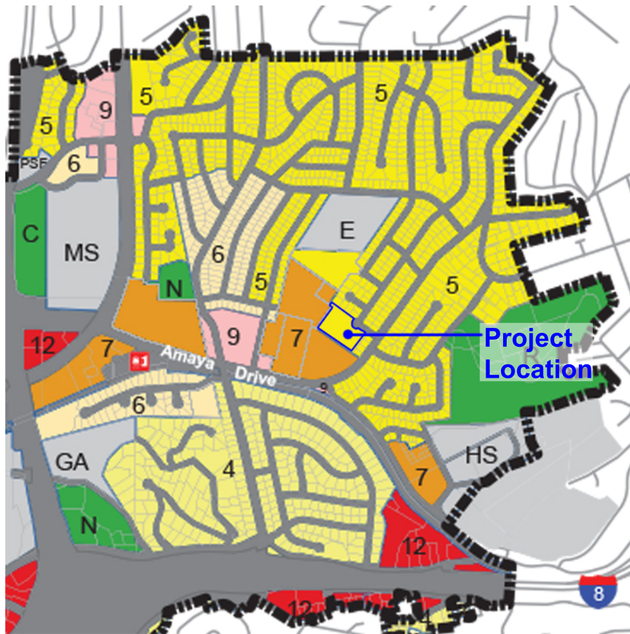
Existing General Plan - Urban Residential