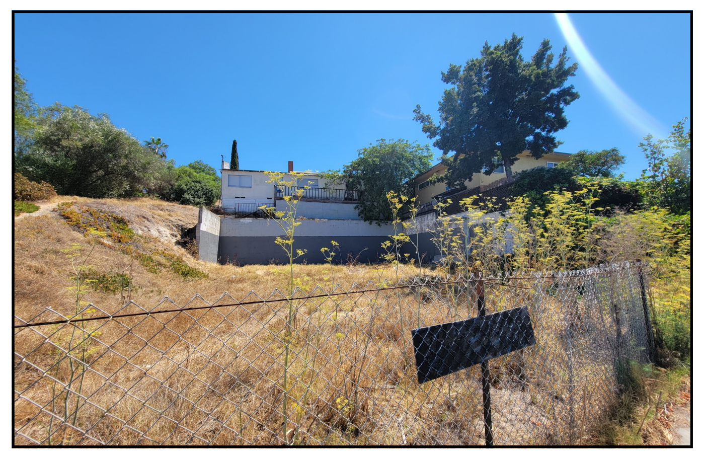
Project site; view from El Cajon Boulevard