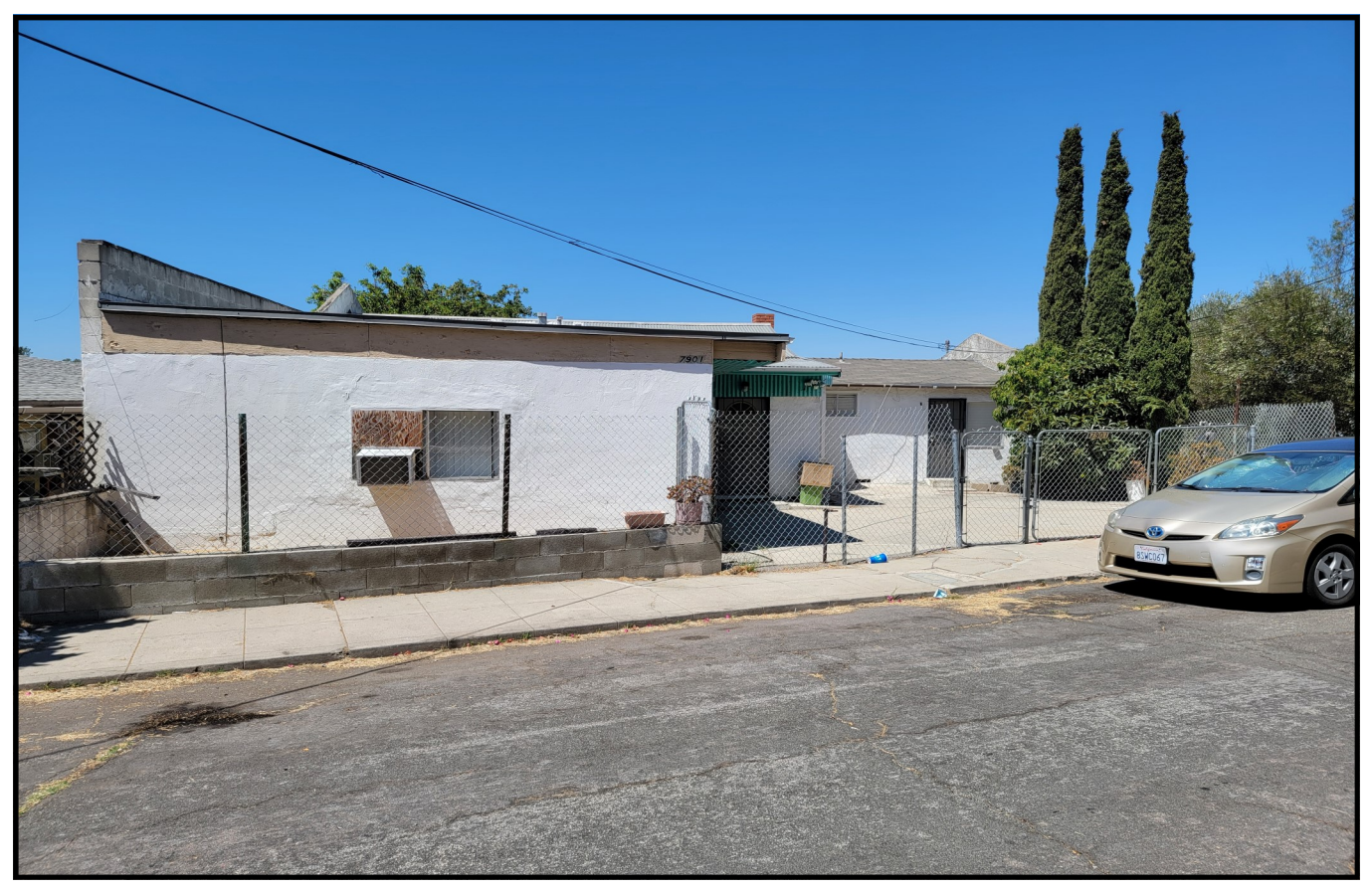
Project site; view from Hillside Drive