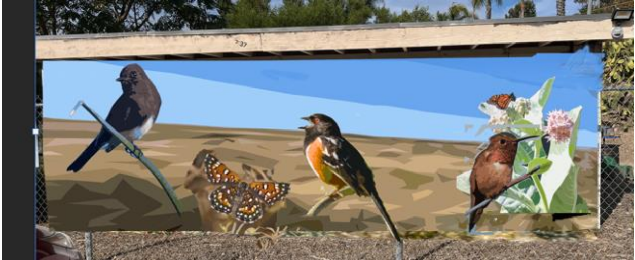
Concept design – Back wall of the garage at MacArthur Park

For the garage, the artist chose some commonly seen smaller birds in the area (Phoebe, Towhee and Allens hummingbird) and two butterflies, the monarch and the Quino Checkerspot, which is endangered. The background is kept simple in color bands.