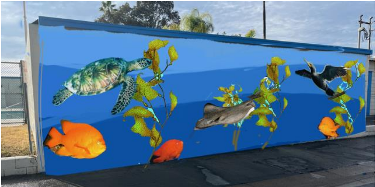
Concept design – East wall of the Municipal Pool at MacArthur Park

For the garage, the artist chose some commonly seen smaller birds in the area (Phoebe, Towhee and Allens hummingbird) and two butterflies, the monarch and the Quino Checkerspot, which is endangered. The background is kept simple in color bands.